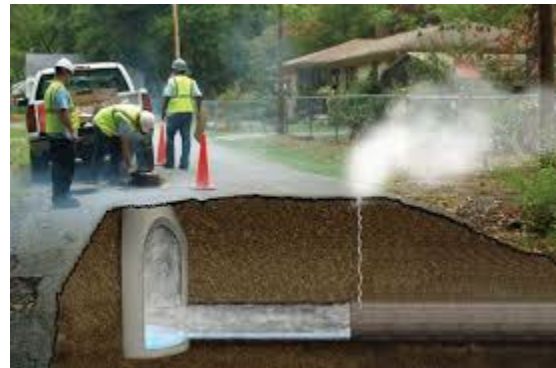
Figure 2 - Crews performing test

your home or yard, phone 911 immediately.