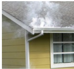
Figure 5 -Smoke Rising from Downspout - Indicates Problem

If you have any additional questions, please call The Village of Whitehouse 419-877-5383.