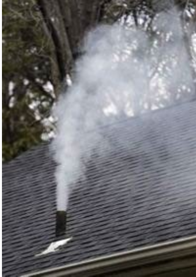
Figure 4 - Smoke Rising from Vent - Typical

Smoke may be seen coming from roof vents, building foundations, manhole covers or yard cleanouts. Smoke coming from roof vents on the roof of homes is a normal occurrence and indicates to the crews that smoke has filled all sewers.